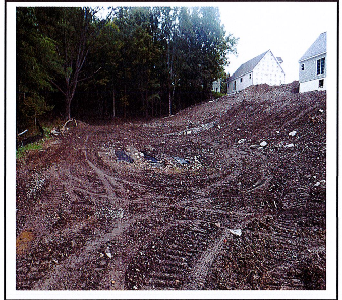
Areas behind house open with no stabilization.