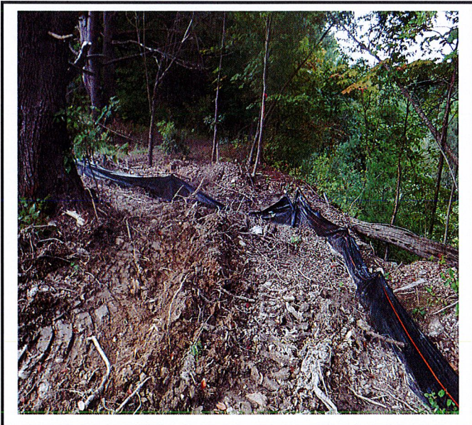
Silt fence still requires attention.