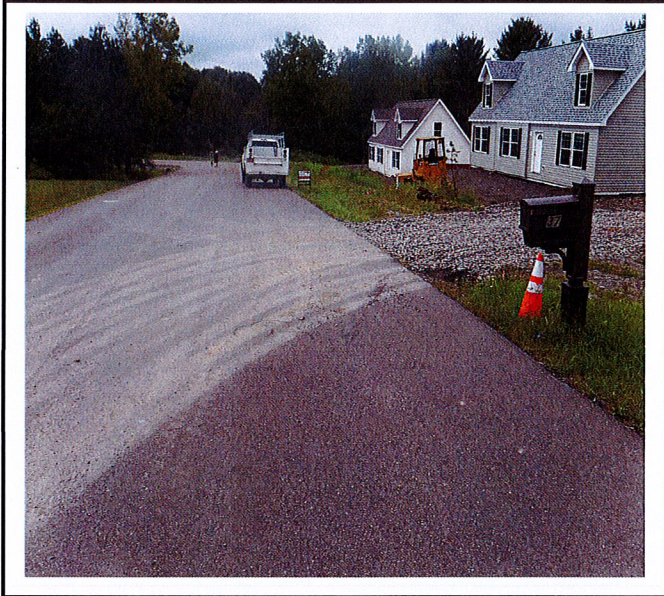
Construction entrance in place but mud is being tracked into the road.