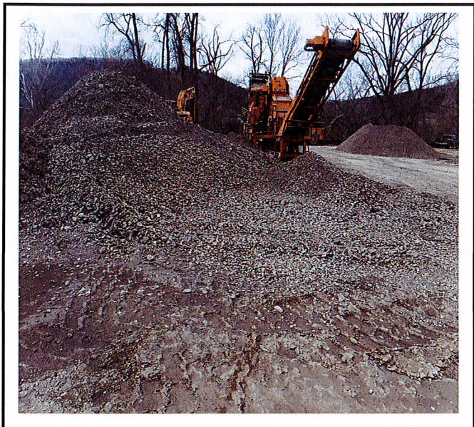
Gravel equipment located where drainage swale is to be constructed.