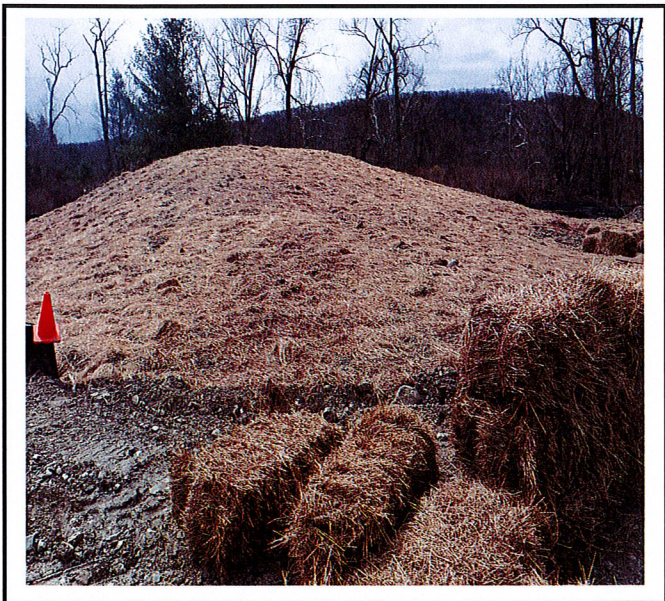
Soil topsoil pile seeded and mulched.