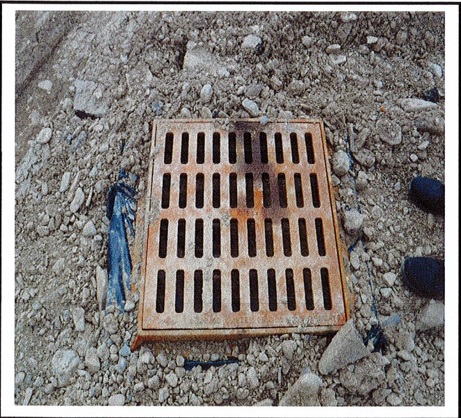
All catch basins have filter fabric under thelids. This is not an acceptable catch basin protection.