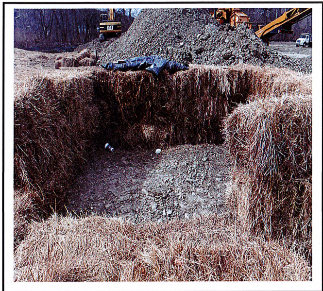
Concrete washout does not have liner.