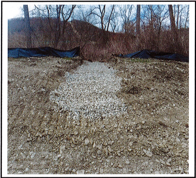
Stone outlet sediment trap is not constructed correctly and the correct stone size. The standard calls for small rip rap 4-8 inches in size.