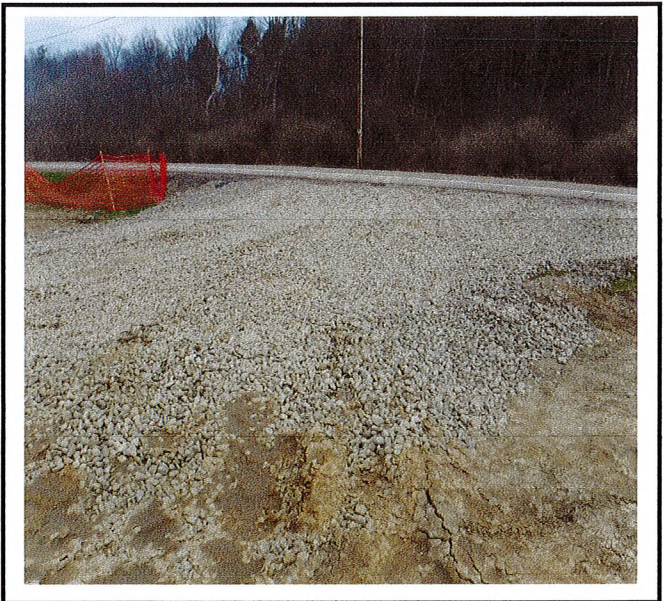
Construction entrance does not appear to be the 50 foot length.