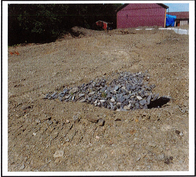
Rock outlet protection into the forebay.