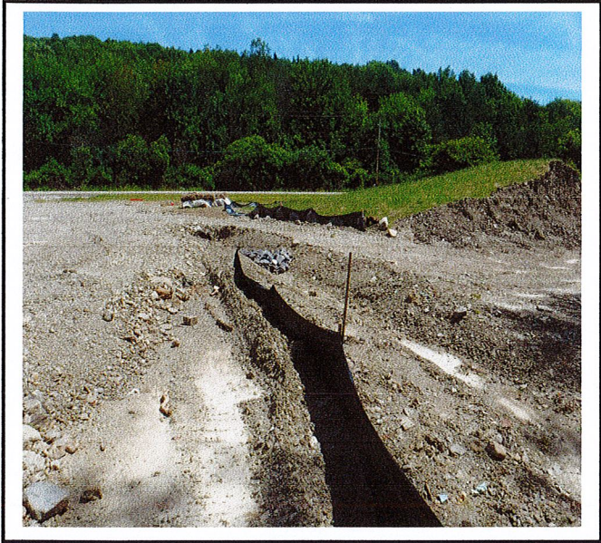
Drainage swale along the east side of property needs to be seeded and mulched.