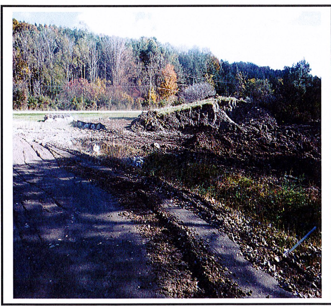
Topsoil area is going to need to be graded and stabilized prior to project closeout.