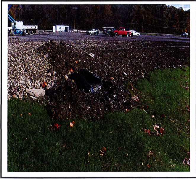
Outlet protection is not installed. Mud has been placed around the storm pipe.