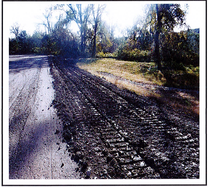
Finalized infiltration basin has been left exposed from recent grading activities. Any sediment getting into basin will be an issue.