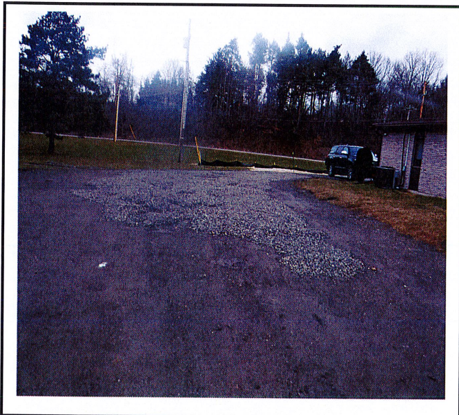
Fresh stone has been put down to prevent tracking.