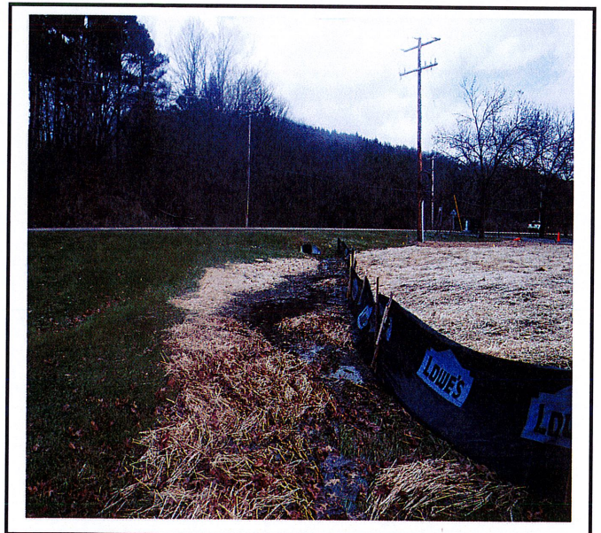
Open soil outside of approved work limits has been stabilized.