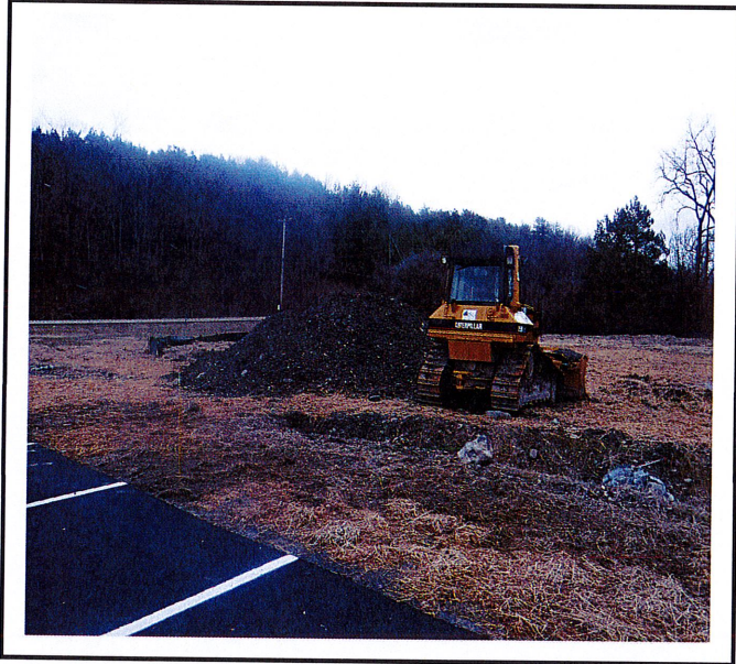
Equipment and soil stockpile still on site.