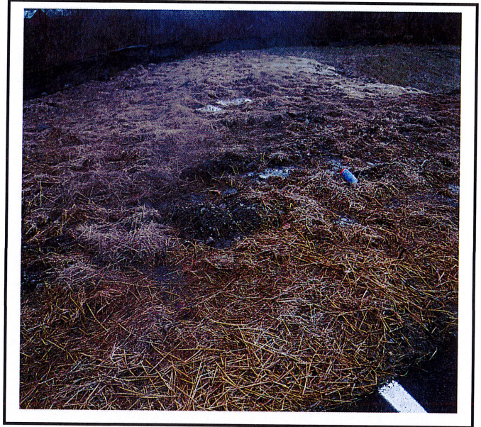
Areas around stormwater basin will need to be re-graded to the original design.