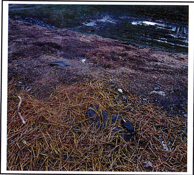
Piles of mortar on the ground needs to be cleaned up.