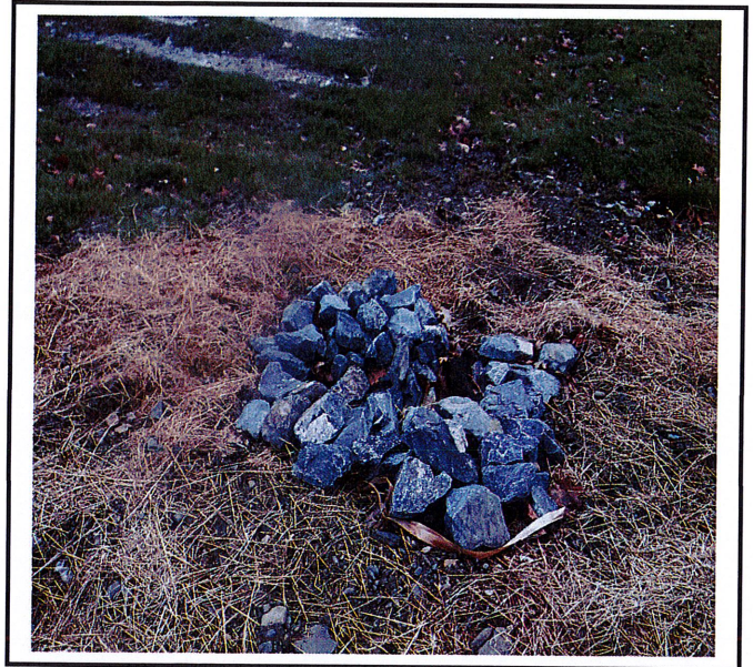
Rock outlet protection is not installed to approved SWPPP.