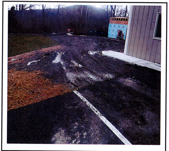
Work is continuing in close proximity to stormwater basin. Care should be taken not to discharge pollutants to the basin.