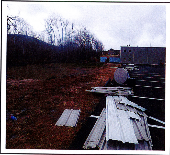
Fuel tank is housed directly next to the infiltration basin. This should be relocated per pollution prevention measures.