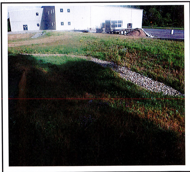
Stone trench in the infiltration basin. Grass is well established.