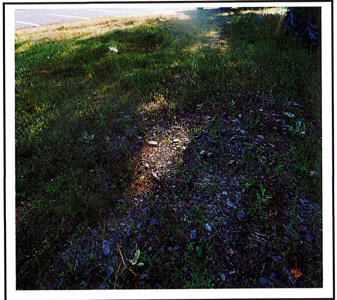
Some areas around the infiltration basin will not grow grass because it is gravel only.