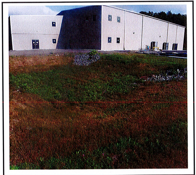
Rock outlet protection installed on the inlets in the infiltration forebays.