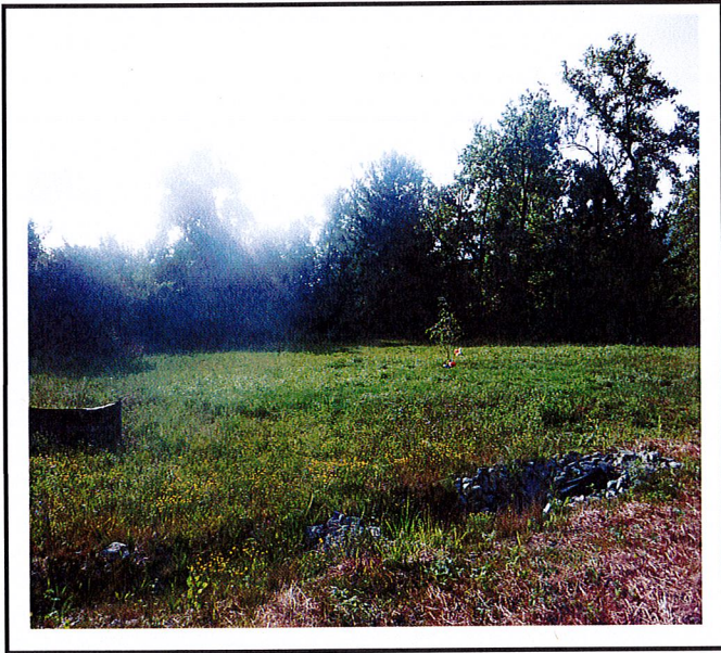
Soil stockpile area is well vegetated.