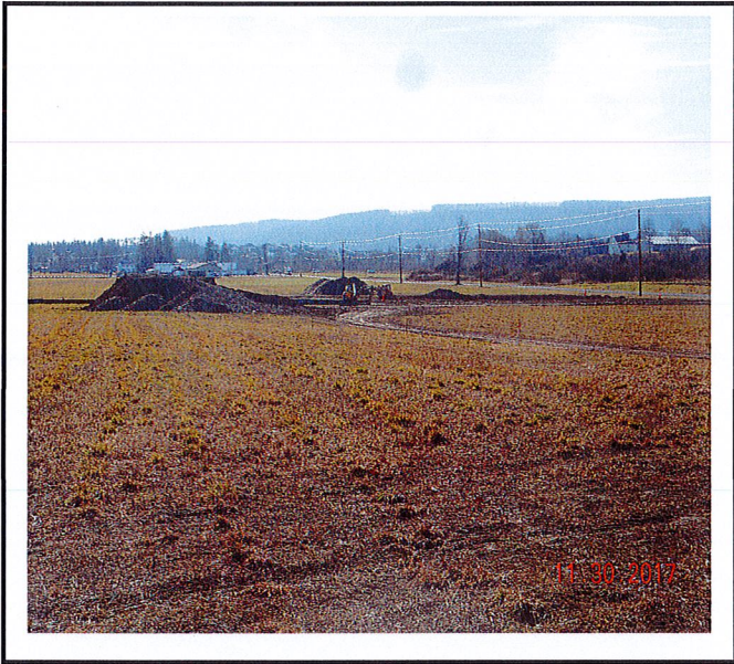
Soil stockpile is being utilized to backfill leach field at this time. Once completed the pile will be seeded and mulch to winter rates.