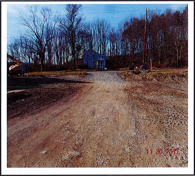
Construction Entrance Installed looks good.