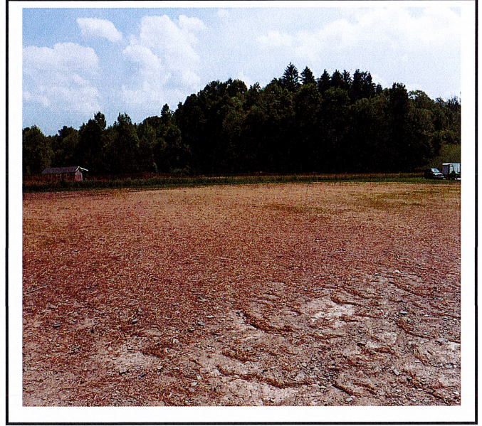
Many areas that have been graded but won't be worked for a while have been temporarily stabilized.