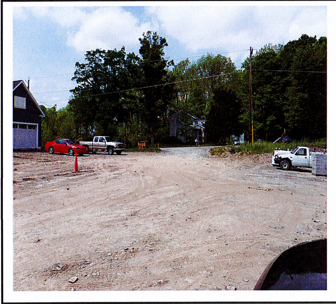
Construction Entrance is functioning well with no issues.