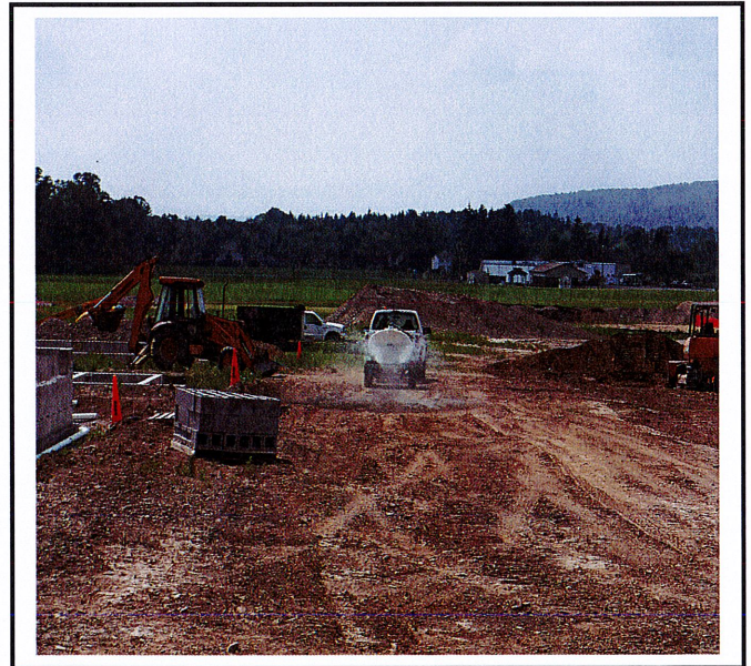
Dust control is being done with a water wagon.