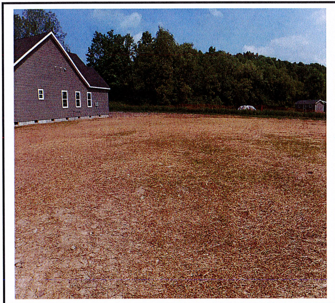
Many areas that have been graded but won't be worked for a while have been temporarily stabilized