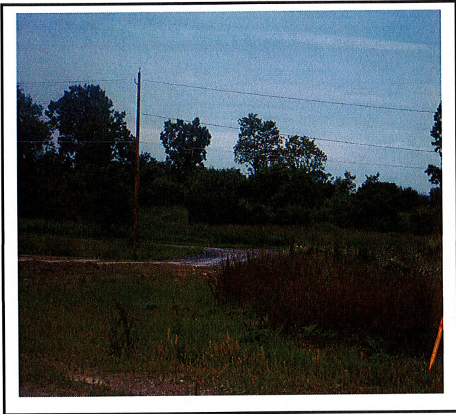
New construction entrance has been installed.