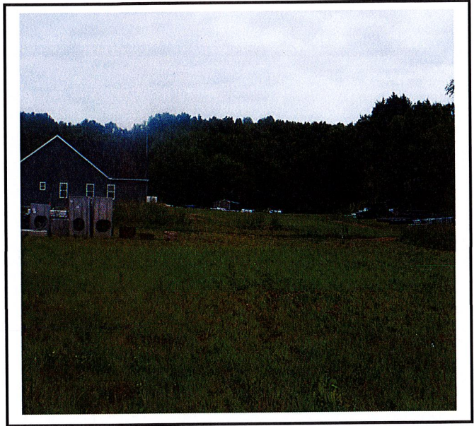
Graded areas have been temporarily stabilized.