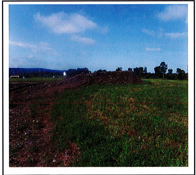
If topsoil pile remains idle then temporary stabilization will be required.