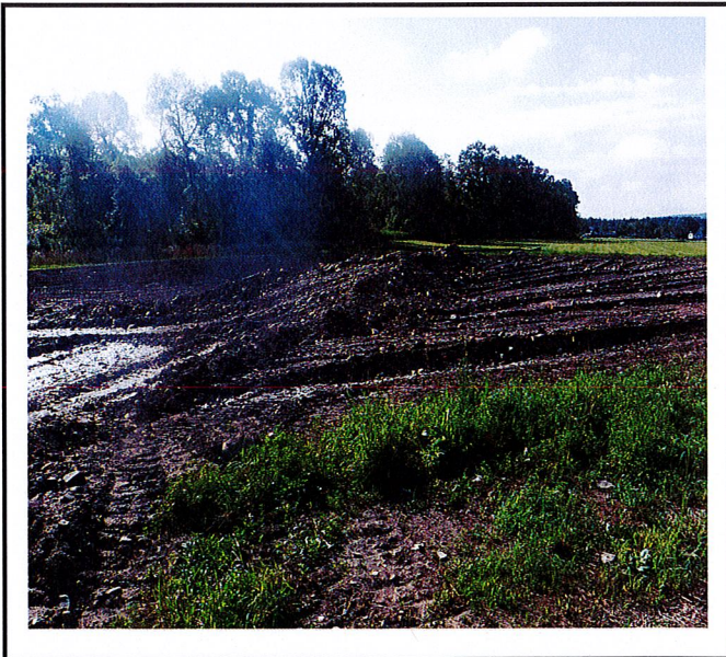
Stormwater basin under construction.