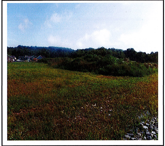
All areas sitting idle have been temporarily stabilized and are growing grass.