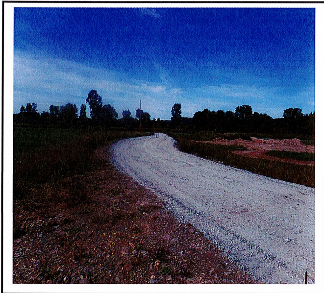
Construction entrance/road in good condition.