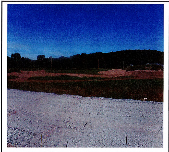
Topsoil piles actively being utilized.