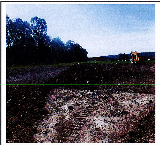
Stormwater basin under construction.