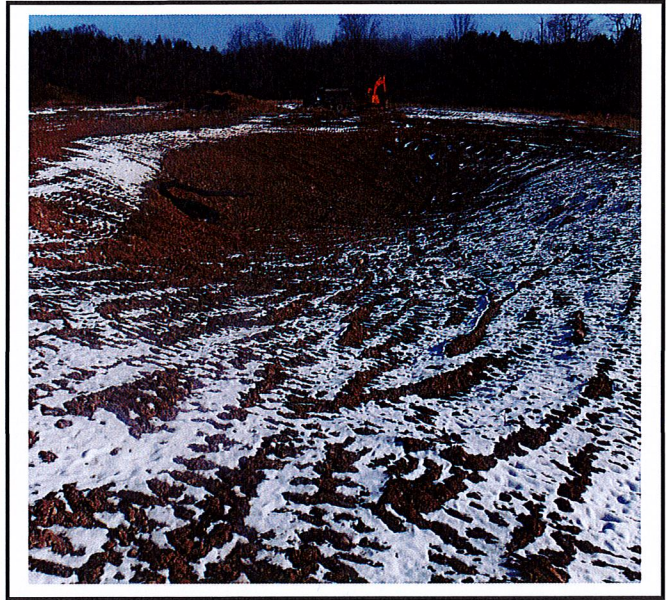
Actively working on stormwater basin.