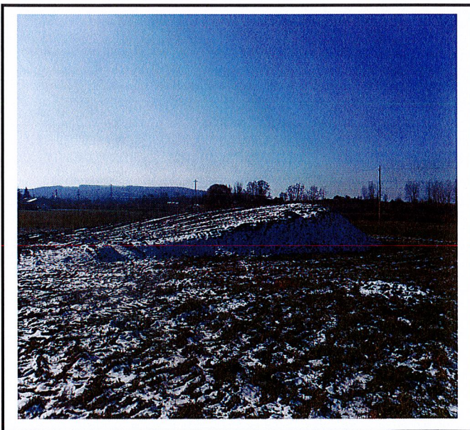
Soil stockpile from stormwater basin.