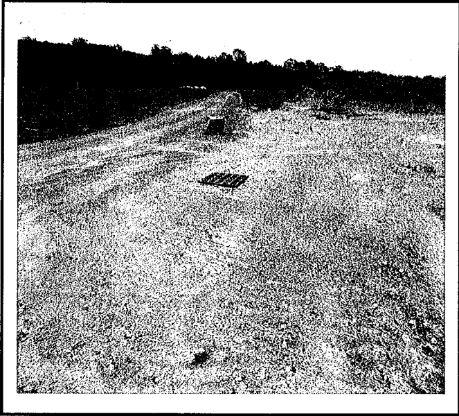
Catch basin needs protection around it.