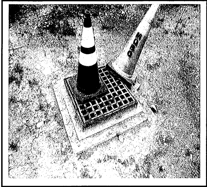
Catch basin needs protection around it.