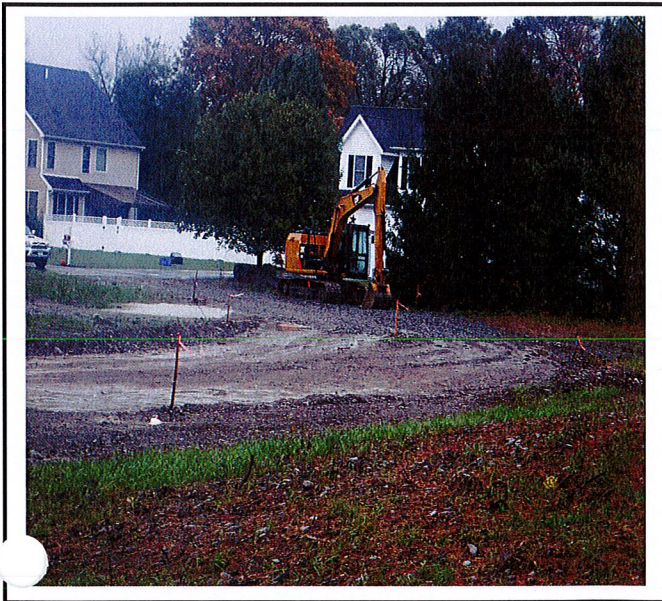
Construction entrance on Steeple Chase side of project installed.