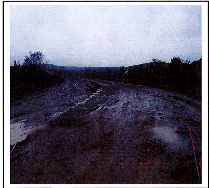
Large area disturbed.