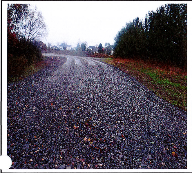
Construction entrance onto Sing Sing Rd. installed.