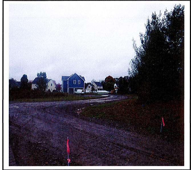
Road cut in over to Steeple Chase.