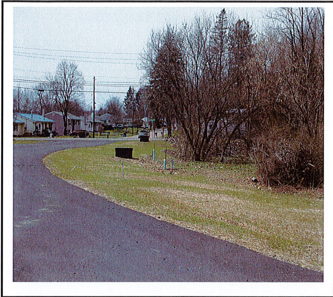
Grass is starting to grow and catch basin protection installed and functioning.