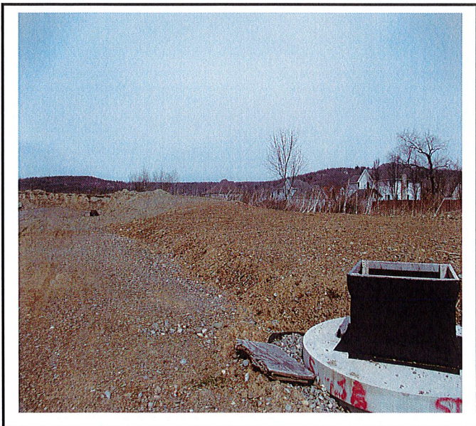
Areas at the rear of the property by Lots 39 and 31 require stabilization.