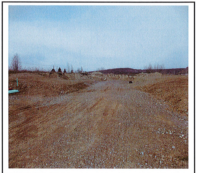
Areas at the rear of the property by Lots 39 and 31 require stabilization.