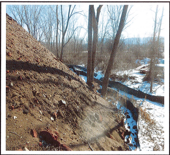
Stockpiles have not been stabilized.