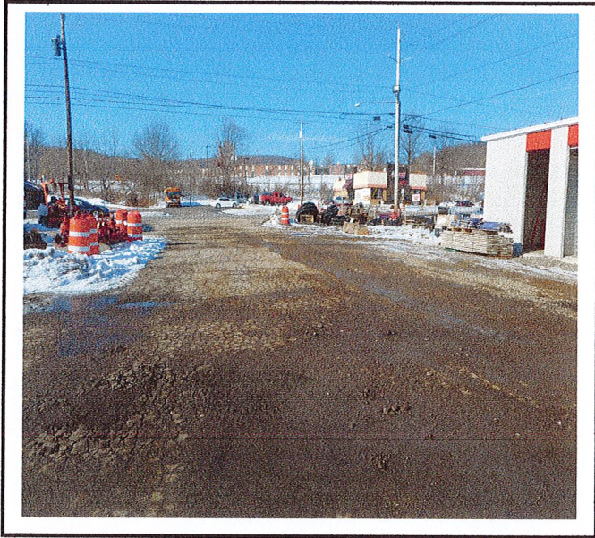
Entrance to project. No tracking out at this time.

PROJECT: UHaul Town of Horsheads Municipal Construction Inspection February 14, 2017 BY: Jessica Verrigni, CPESC, CPSWQ