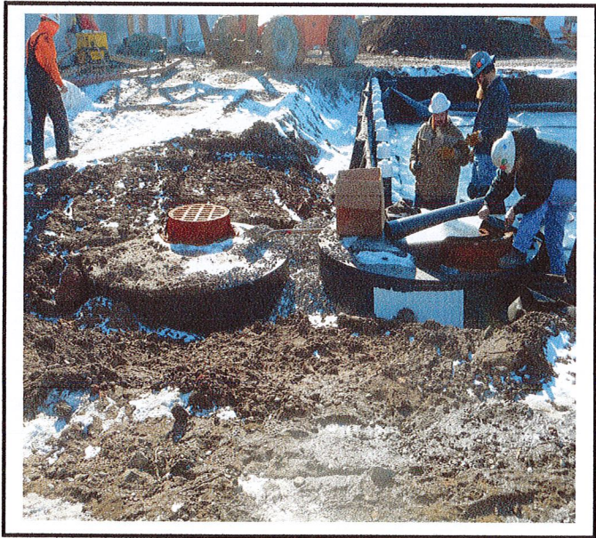
DB 1 and DB 2- Workers installing membrane around DB 2.