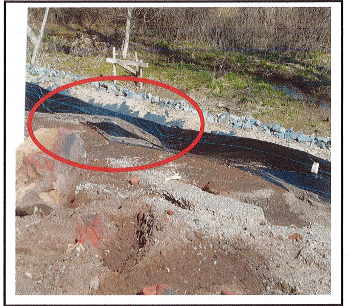
You can see sediment from flow test buried first row of silt fence and came close to going over second fence into stream.