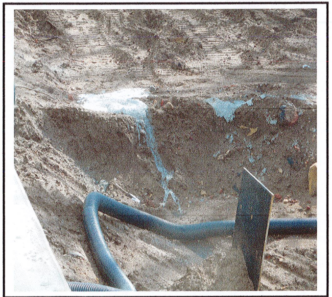
Concrete washed all over project due to lack of washout area.