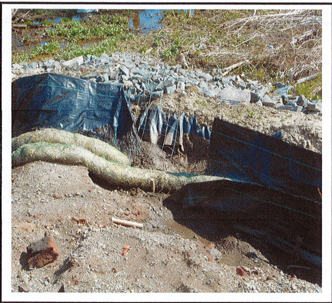
Lack of maintenance