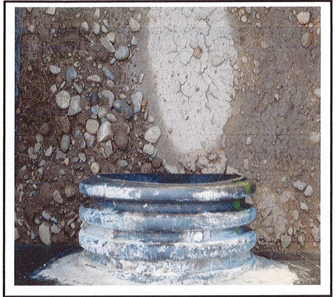
This is what the inside of them look like.