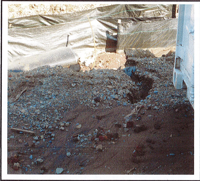
Contractor flow tested hydrant onto ground and cause major erosion.