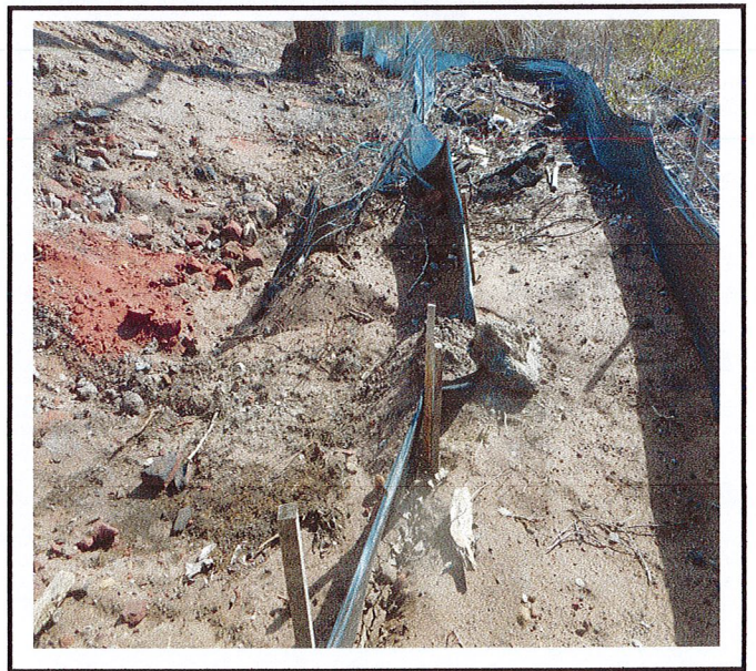
Lack of maintenance