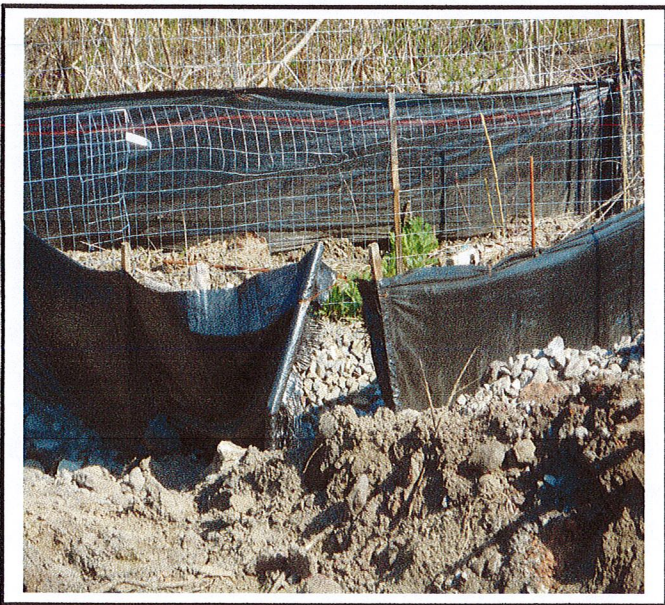
Silt fence requires maintenance in many places.