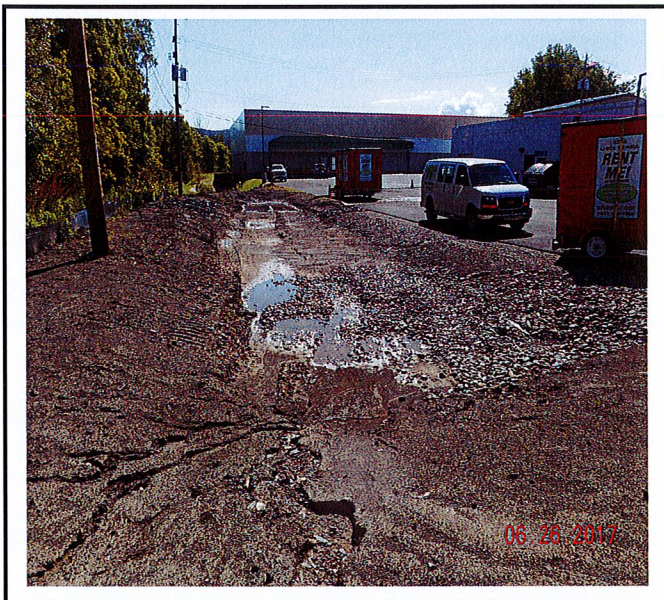
Erosion into the detention pond. Detention pond does not appear completed.