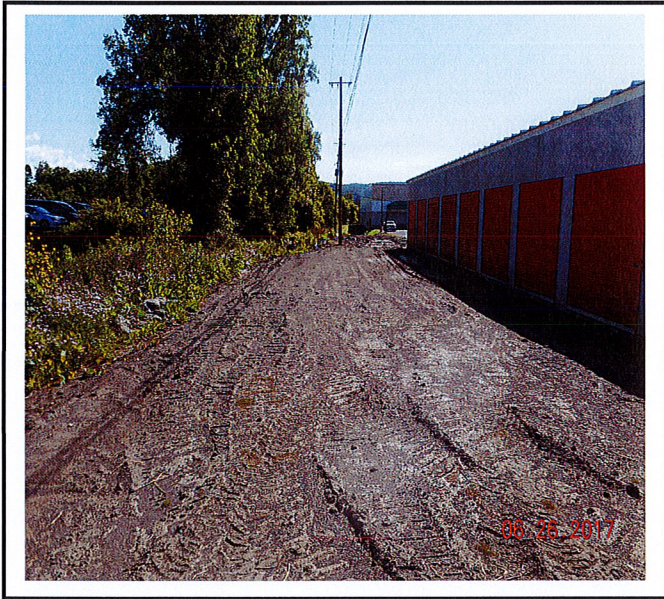
Area next to Building B does not appear to have been topsoiled, had soil restoration performed and has not been stabilized.

PROJECT: UHaul Town of Horseheads Municipal Construction Insp. June 26, 2017 BY: Jessica Verrigni, CPESC, CPSWQ