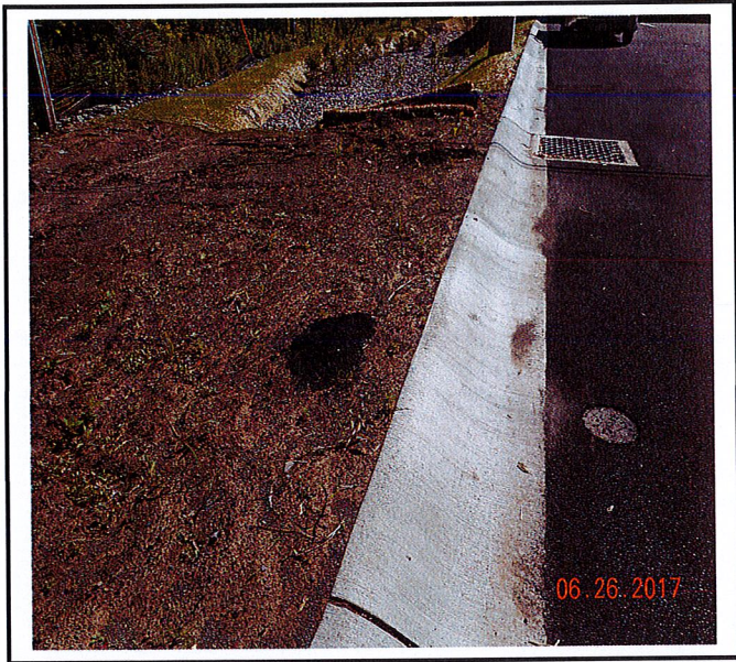
Blacktop piles can be found thrown onto the graded areas around the project site. These need to be cleaned up.