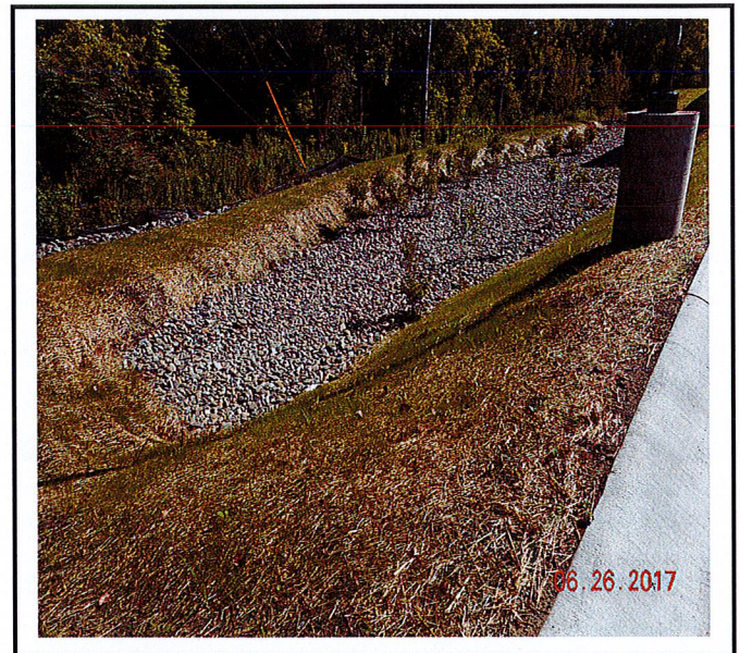
Rock slope protection has not been installed on the slope of north bioretention basin.