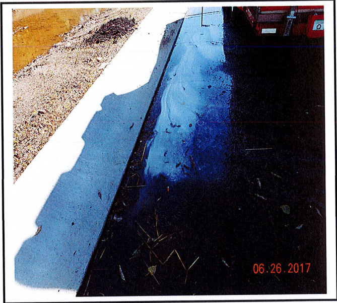
Paint brushes were being washed onto the new pavement at the time of my visit. I stopped it and spoke with the store manager about it.