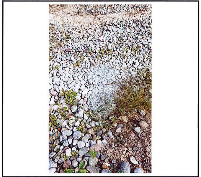
Concrete has been washed into the stormwater detention basin. This material needs to be removed when re-shaping and final grading occurs.