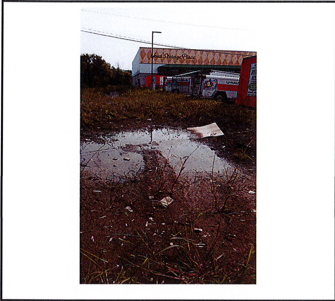
Standing water within the stormwater detention basin