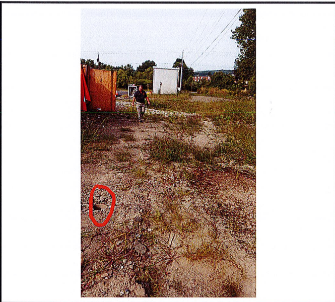
Pipe leading to something underground was located within the detention basin.