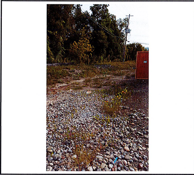
Stormwater Detention Basin needs to be finished.