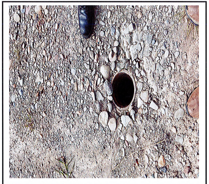
When looked down the pipe with a flashlight it is stone on the bottom. BEFORE finalizing grade of detention basin identify what this is.